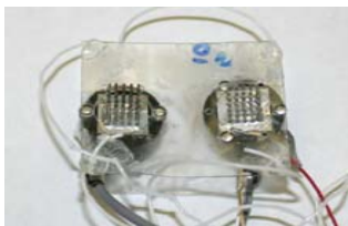
Figure 1: Fiber-coupled light emitting diodes (LEDs, left side) emitting 740, 810, and 880 nm light illuminated the head and a fiber-coupled photodiode (right side) collected light scattered from the cortex. The fibers were encased in hyperdermic tubing which collected electroencephalographic signals from the cortex.